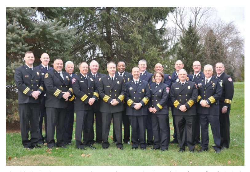
The 2018 Fire Service Executive Development institute (FSEDI) met for their 3rd and final session of their basic program in Leesburg Virginia, Dec. 1-5.