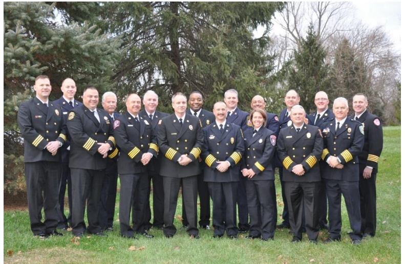
The 2018 Fire Service Executive Development institute (FSEDI) met for their 3rd and final session of their basic program in Leesburg Virginia, Dec. 1-5.